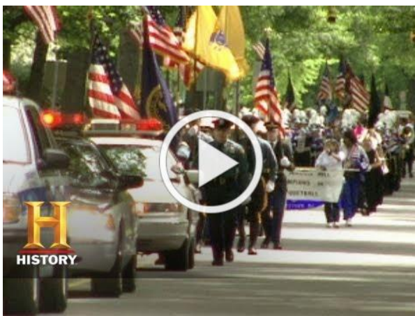
History of the Holidays: Labor Day History video

Never miss an opportunity to apply for funding through the Lancaster County Workforce Development Board! By signing up here , you will be notified any time Requests for Proposals (RFP's) are released.