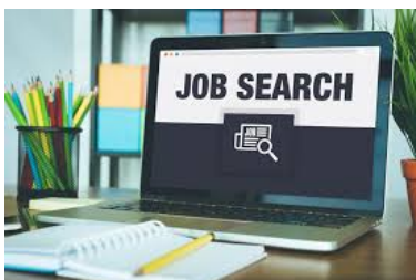
Resources for Jobseekers