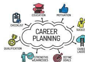
Resources for Students and Educators

Subscribe to Career Corner , a newsletter for job seekers published by PA CareerLink® Lancaster County that includes hot jobs, recruitment events, and more!