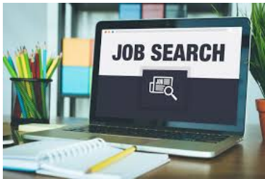
Resources for Jobseekers