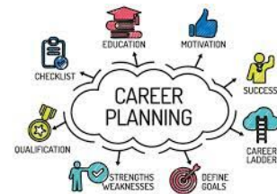
Resources for Students and Educators

Subscribe to Career Corner , a newsletter for job seekers published by PA CareerLink® Lancaster County that includes hot jobs, recruitment events, and more!