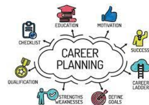
Resources for Students and Educators

Subscribe to Career Corner , a newsletter for job seekers