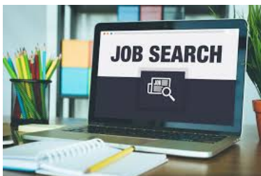
Resources for Jobseekers