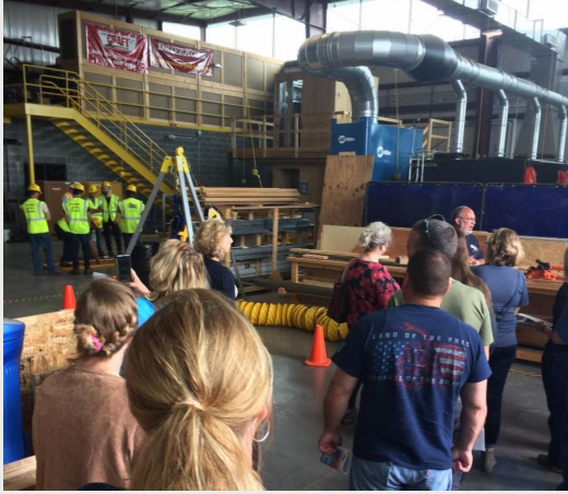
Pictured are educators who attended Educator Industry Tours at ABC Keystone last summer following the establishment of the Next Gen Construction Partnership.